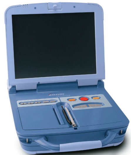
Figure 1. Model 3120 ZOOM Programmer